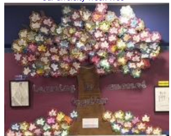
Displayed in the School Entrance